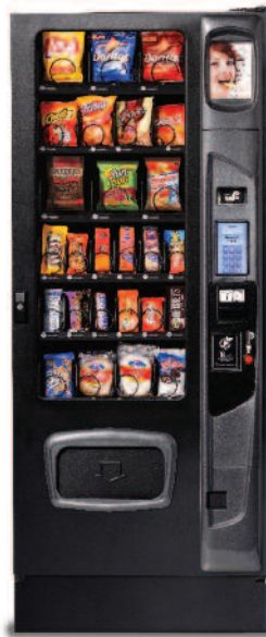
Shown with ADA door, iCart touch screen & kick panel options.