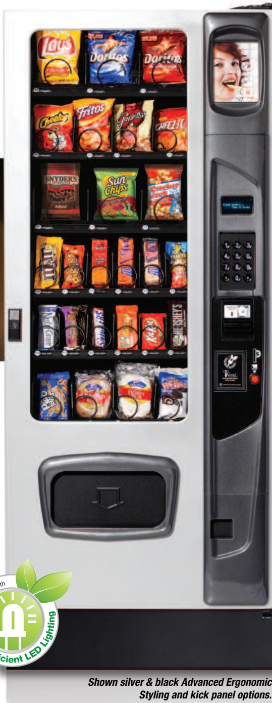
Shown silver & black Advanced Ergonomic Styling and kick panel options.

The Mercato 3000 glass front snack merchandiser incorporates all the proven features you expect in a new design and includes additions that increase the value for choosing USI.