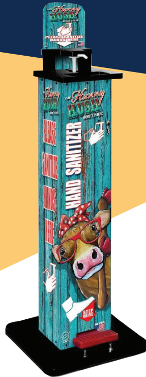
COMPLETE CUSTOM GRAPHICS