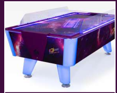
Protective 3-piece side shields are standard on Cosmic Thunder