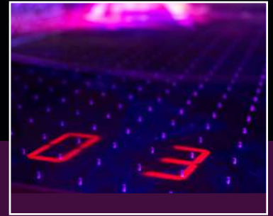
LED scoring readout underlit from the playfield