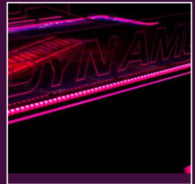
LED top rail lighting complements the full-table LED array