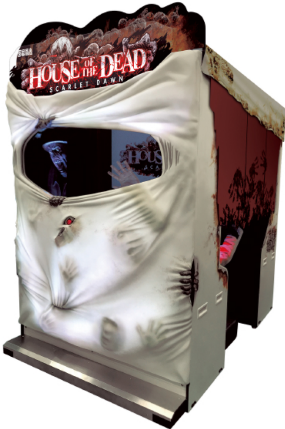
House of the Dead Scarlet Dawn SDLX